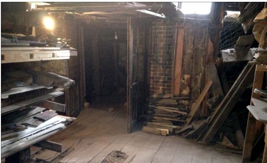
View of the basement entrance to the sidewalk vault. Some of the wall boards have 1898 newspapers glued to them.

that appears in our 1905 photos of the mercantile. With the store out of business, it just became patching material.