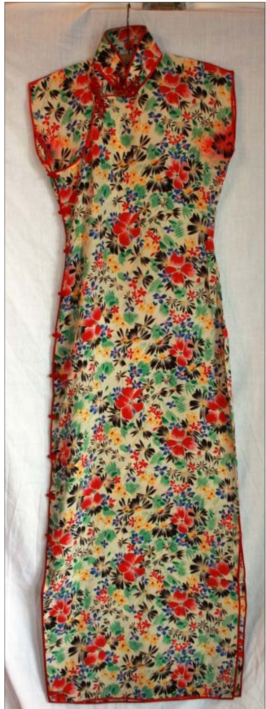
MW2014.03.01: white silk with red, blue, green, black and yellow flowered pattern and hand-stitched red satin frogs and piping.