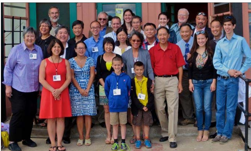
Chinn Family reunion group

The Mai Wah deeply appreciates the generosity of all the family members to the Museum. It was a joy to host their reunion.