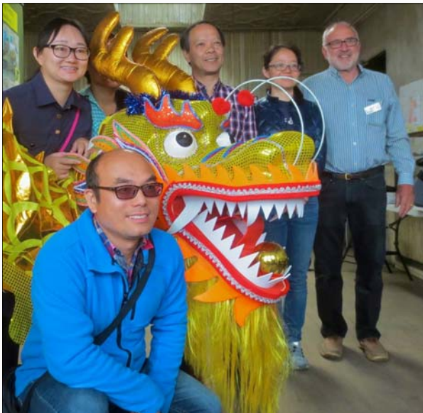
Sun Yat-sen visitors.