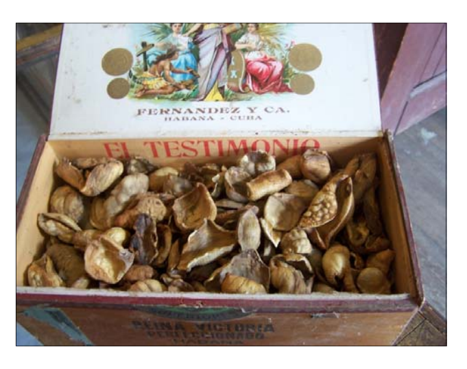
Pangolin scales, featured in one of the Mai Wah Museum's blog posts.