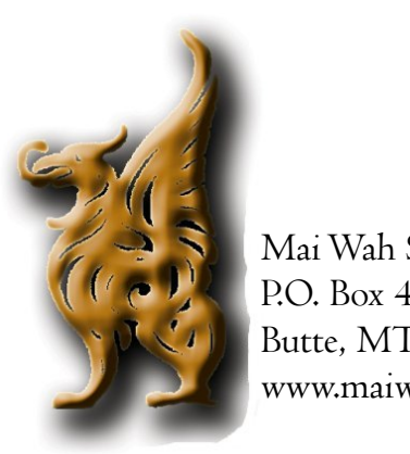
Mai Wah Society P.O. Box 404 Butte, MT 59703 www.maiwah.org

PRST STD U.S. POSTAGE PAID Butte, MT PERMIT NO. 593