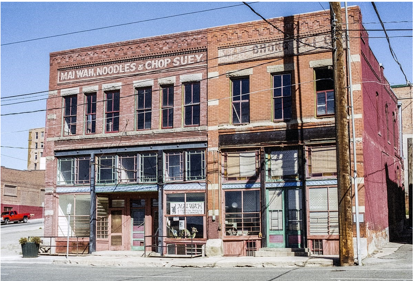
Preserving and interpreting Butte's Asian history and culture

Prioritizing recommendations is underway and we are confident that all necessary work can be completed with the help of our friends. Details of our planned funding raising campaign are provided elsewhere in this newsletter.