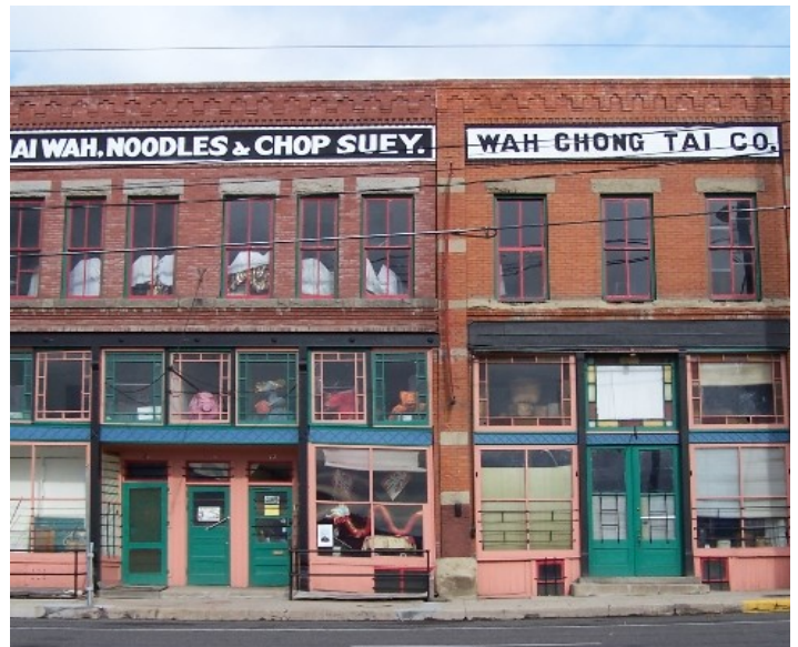
Mai Wah Society

We greatly appreciate all of the business sponsors and volunteers that made the 2017 Chinese New Year Parade a success! If you were unable to attend the parade this year, the Montana Standard provided some great coverage, including a front-page story and posting some video on YouTube. The article can be read at: https://tinyurl.com/Butte2018 . The video can be viewed at: https://tinyurl.com/VideoButte2018 .