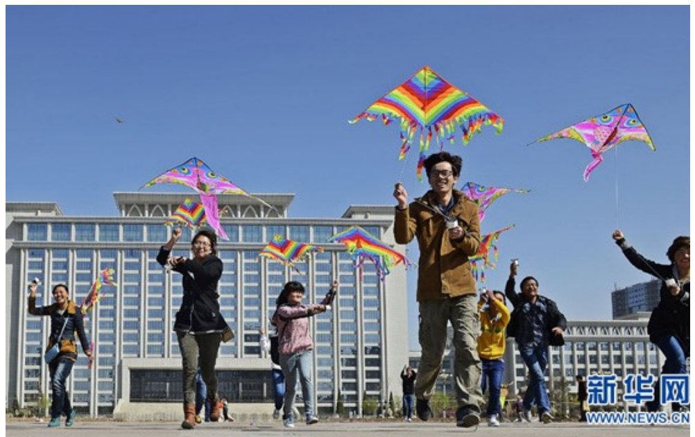
Qingming Festival in China : Flying Kites