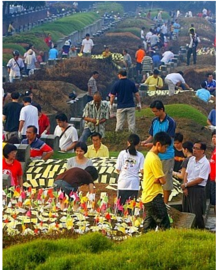
Qingming Festival in China

Qing Ming is in March, and it is a rainy period, everywhere is wet especially in the southern China, people can hardly see the sunny sky, so they will feel sad and gloomy in those days. In the poem, people move along sadly, so they want to forget the sad things by drinking alcohol. In some place such as Guangzhou, people will not stay outside for a long time in this period in some places alone, especially at night, because the door of the underworld will open, and the ghosts of the dead and the evil staff will come out and follow you to your home and people will possessed by these staff. So usually there are few people will walk outside on the street in that period.