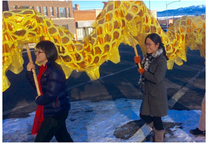
2017 Business Blessings