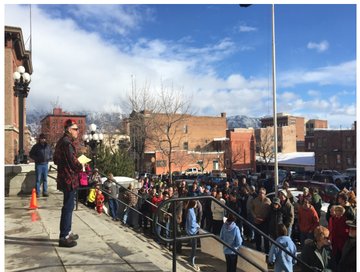
Chinese New Year Parade