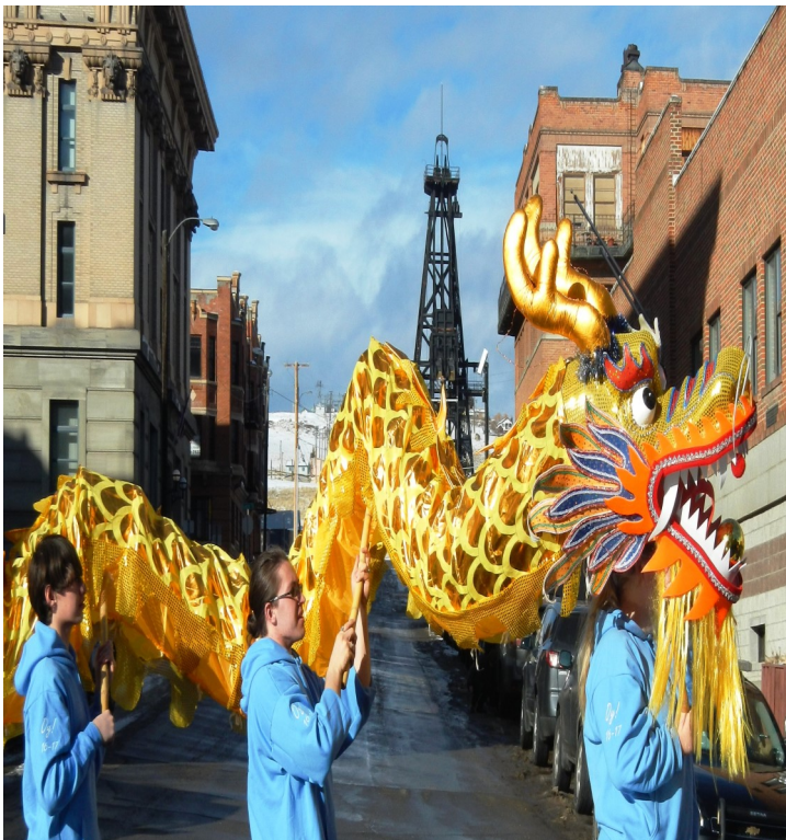
“Year of the Dog” Starts with Parade in Uptown Butte