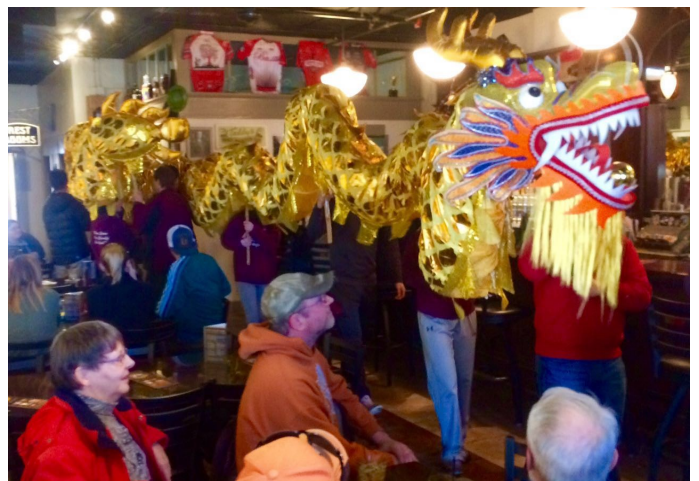
2017 Business Blessings