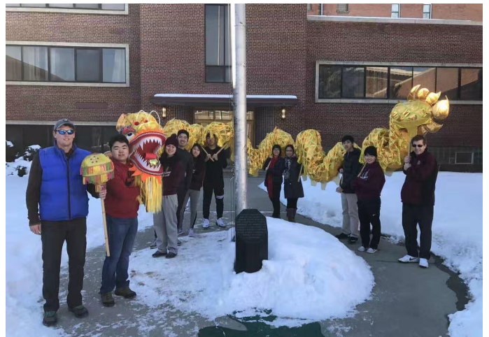
2017 Business Blessings