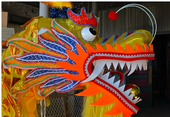
Chinese Dragon from SYSU, China